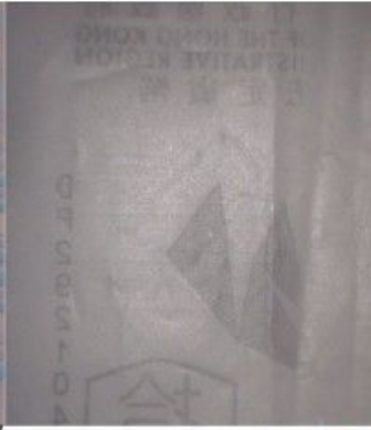
AM4115-FIT or FJT with IR 850nm or 940nm