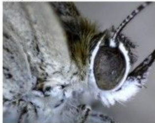
Butterfly with EDOF