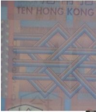
AF4115ZT w/o IR