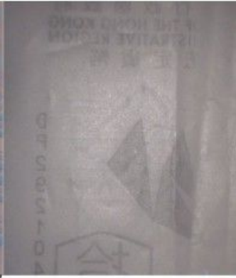
AM4115-FIT or FJT with IR 850nm or 940nm