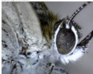
Butterfly with EDOF